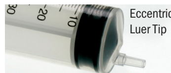
Eccentric Luer Tip